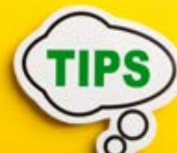
Sgt. Penny Saver's Tip page 2