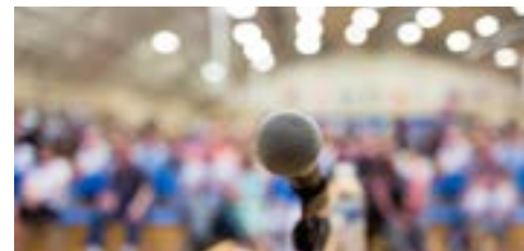
2026 Annual Meeting Recap page 4